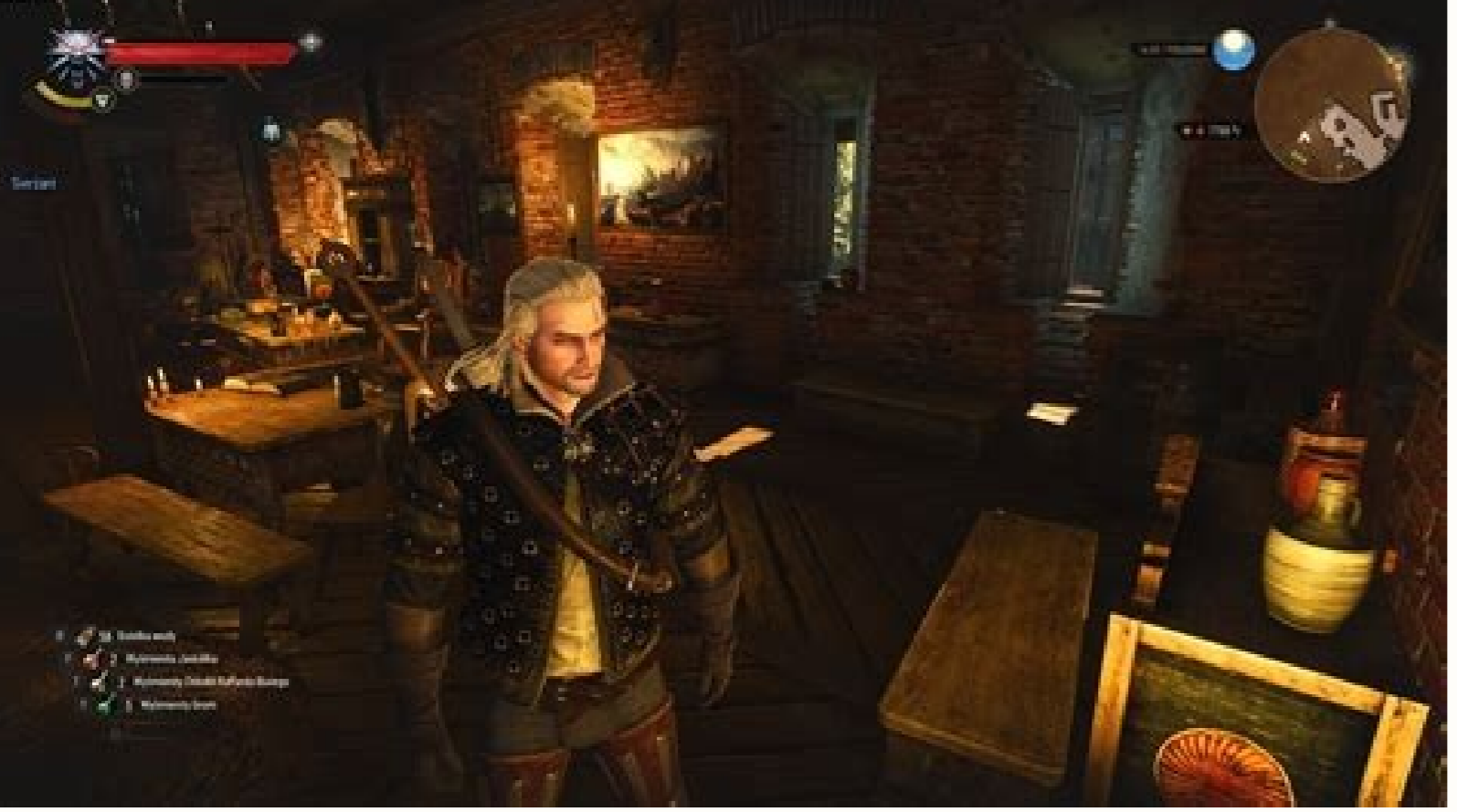
The witcher 3 wild hunt update 1.31.